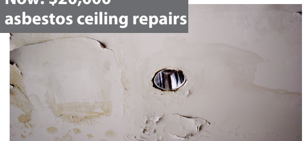
Now: $20,000 asbestos ceiling repairs

Asbestos is safe when it's contained - as it is in its current state in the Pinecrest Campus. However, any time a repair needs to be made, in a leaky ceiling, faulty light, chip in a door frame, the repairs become expensive and disrupts the educational process. Removing all asbestos will avoid future expenses and disruption.