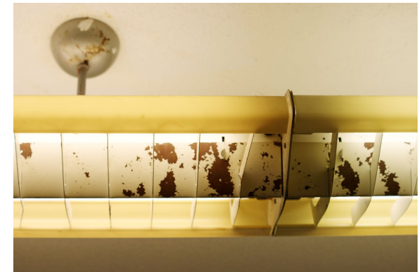
After: $35 ceiling repairs