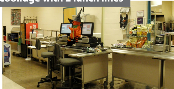
Fully functioning kitchen at Coolidge with 2 lunch lines

Ferndale Schools need equality in our school kitchens this need will allow us to equal out the lunch-time experiences at all our sites. We hope to be able to have full-service kitchens at Roosevelt and University High School like those at FHS, JFK and Coolidge, so we can prepare, instead of heat, lunch on site for all students.