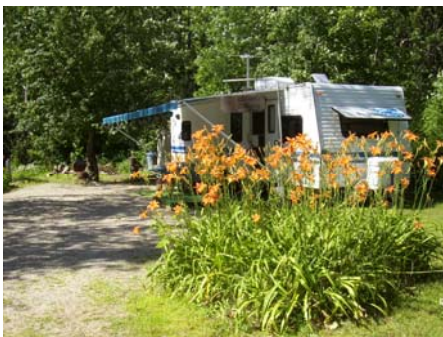
Wilson's Getaway – Lot #60