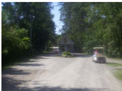
Ranger Station (Check-In) $4.00 per Car

Horseshoes Softball Putt-Putt Basketball