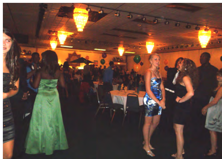
With its dim lights and formal décor, most students said DeCarlos provided the perfect setting for an elegant night.